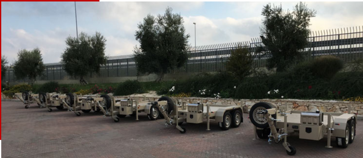
Approved On-Road Trailers, Gross Weight 3,5 Ton, Designed for Military Equipment