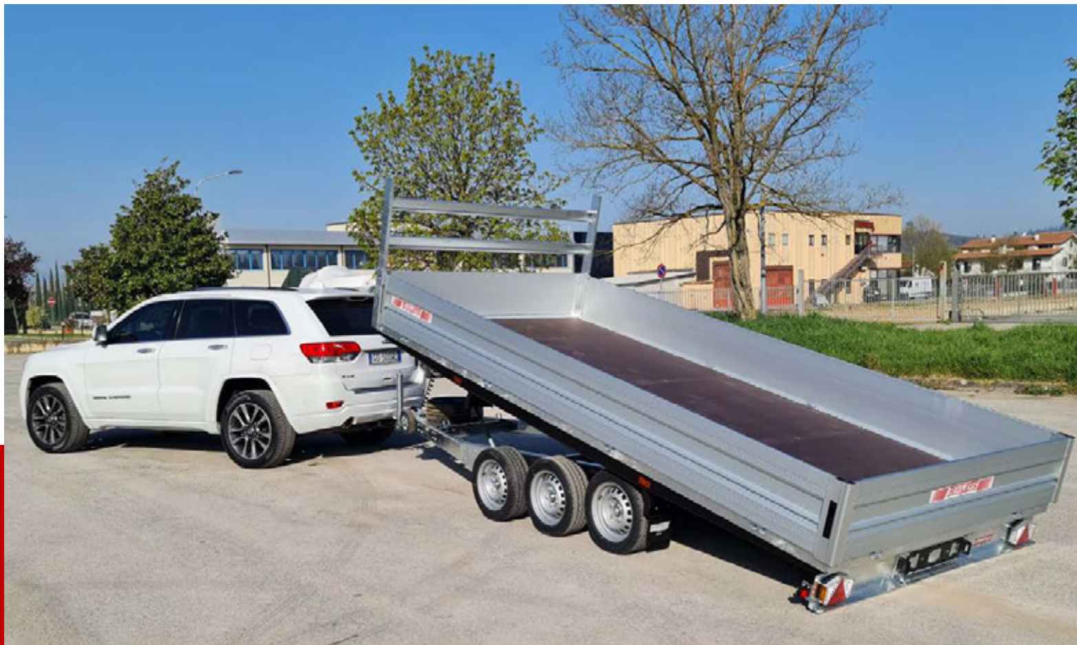
Approved On – Road Trailer, Gross Weight 3,5 Ton, Length 5,5 m