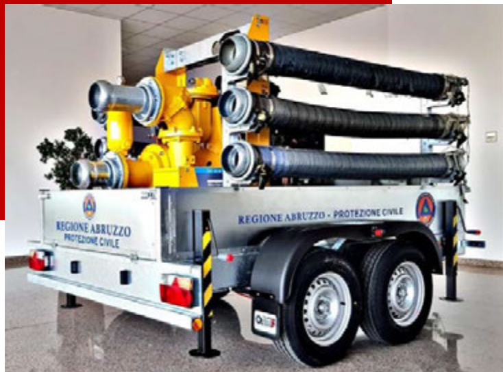
Approved On – Road Trailer, Gross Weight 2,5 Ton, Designed for special equipment