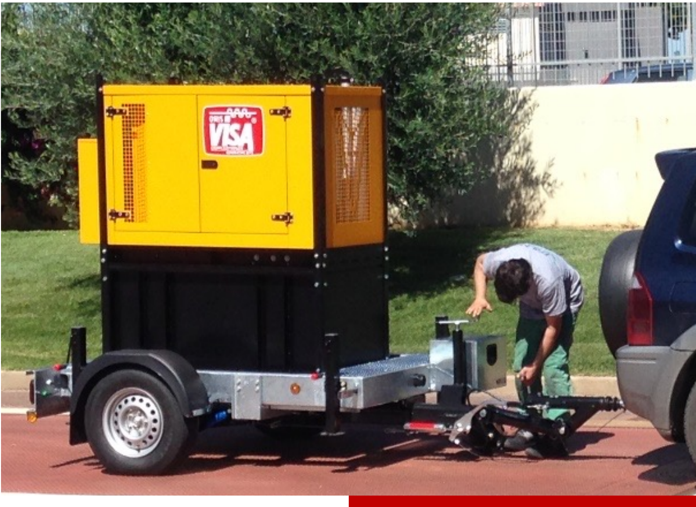
Approved On – Road Trailer, Gross Weight 1,8 Ton, Designed for 20 kVA Generator