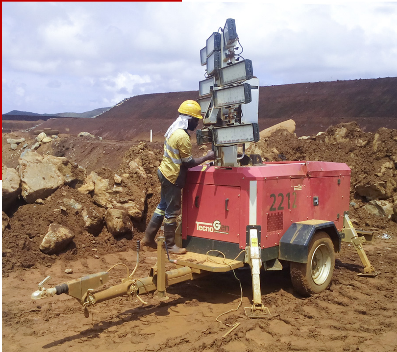
Approved Off – Road LED Lighting Tower, Gross Weight 2,5 Ton