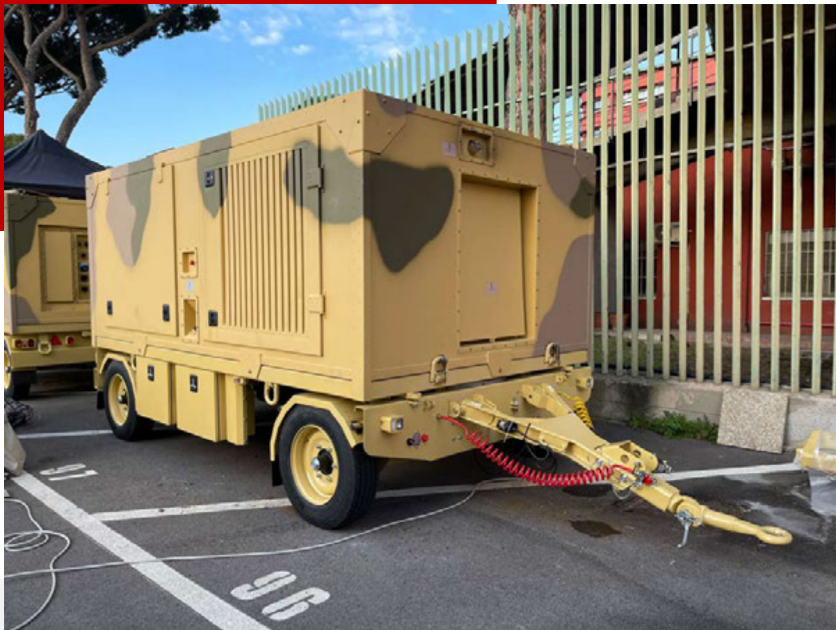
Approved On – Road Trailer, Gross Weight 6.0 Ton, Air Brake System, Custom Solution