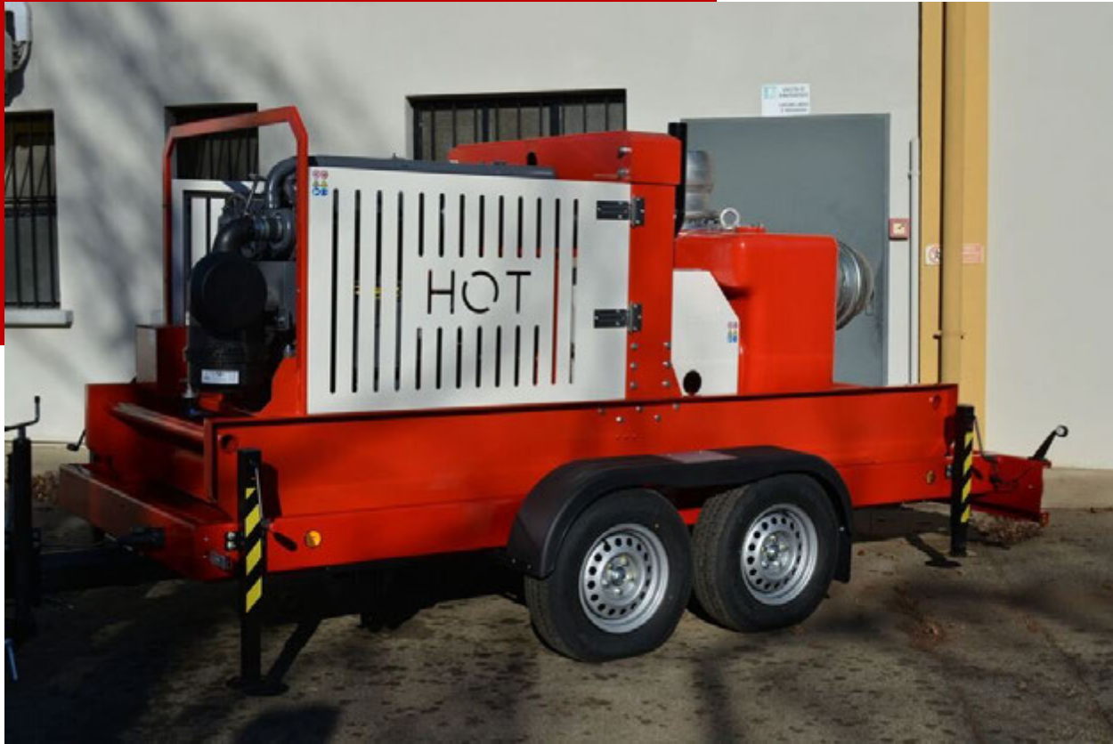
Approved On – Road Trailer, Gross Weight 3,5 Ton, Designed for Millar 10” Pump